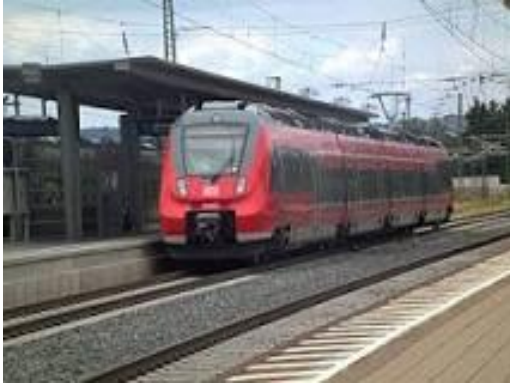
S - Bahn