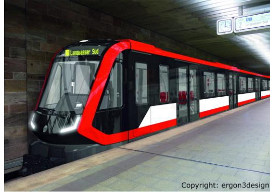
U - Bahn